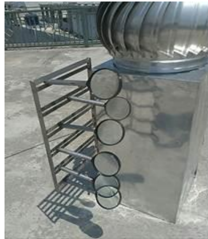
Fig. 4. Lenses