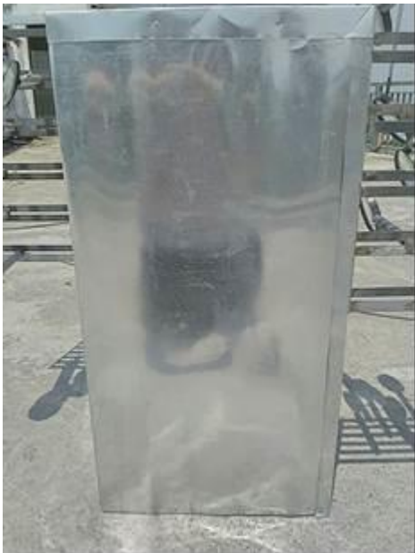
Fig. 2. Air Column