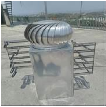
Fig. 1. Solar Reflector Cyclone Wind Turbine Generator