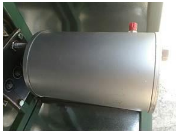
Fig. 5. DC generator