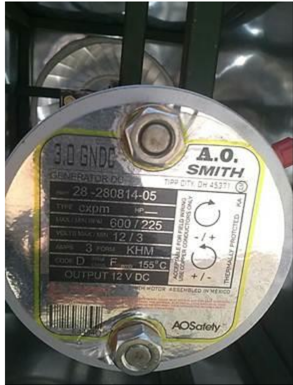
Fig. 6. DC generator specification

The specification of the generator is shown in Figure 6.